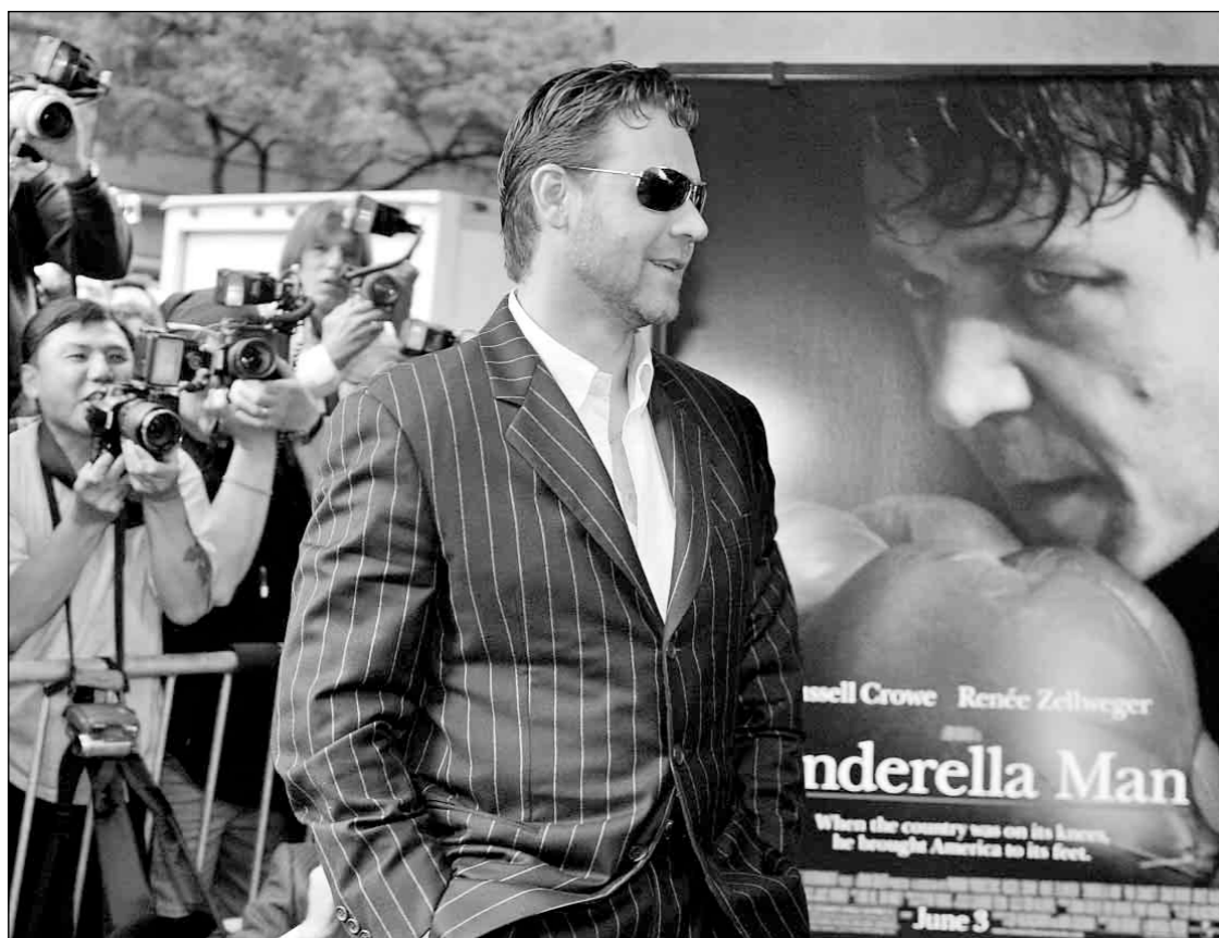
Russell Crowe arrives for the premiere of Universal Pictures' "Cinderella Man," a benefit screening for the Children's Defense Fund last Wednesday in New York.